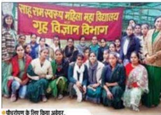
● पौधरोपण के लिए किया अवेयर.